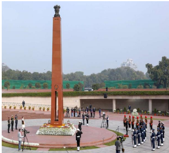
National War Memorial

India Gate is an imposing structure, a triumphal archway 45 metres high. Built in 1921 by the Imperial War Graves Commission to honour the Indian and British soldiers who lost their lives during World War 1 and the Anglo-Afghan War, there are 13,516 names inscribed on it.